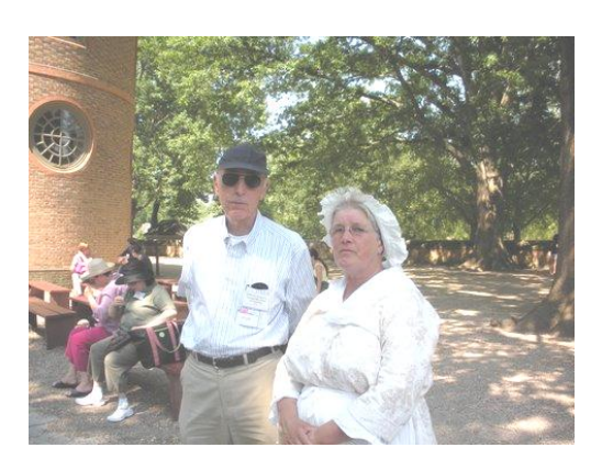
A docent at Colonial Williamsburg