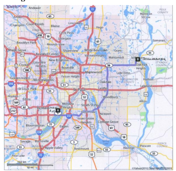
By Air: Minneapolis-St. Paul Airport, located south

of Minneapolis, is the major airport serving the area. Turn right from the airport entrance road onto Rt. 5, go southwest about a mile and then take the Exit onto I-494 towards the east. Follow I-494 east curving north on