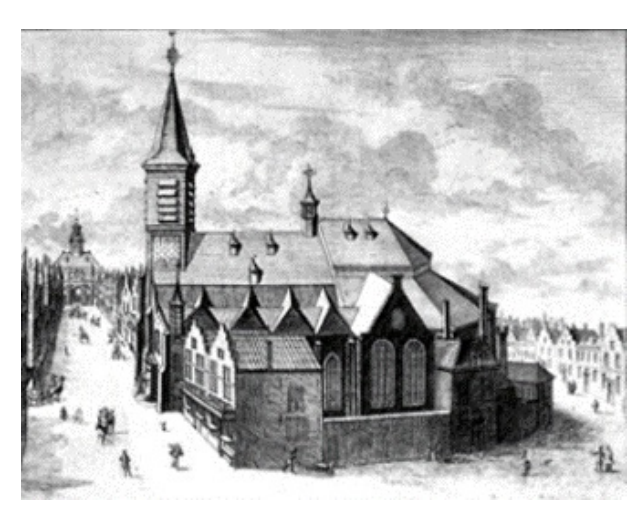
Vrouwekerk (Walloon Church)