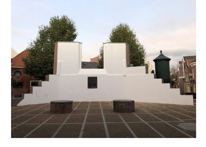
The Vrouwekerk Memorial in 2022