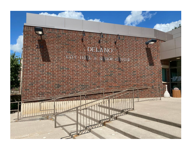
Delano, MN City Hall and Senior Center

It won't be long now! Please put the dates of September 16, 17, and 18 on your calendar and plan to join us either in person in Delano, Minnesota, or on Zoom. Registration for the annual meeting and hotel information is now open and you may do so by going to the Delano Kindred website (www.delanokindred.us) and clicking on the "Reunion" menu at the top of the page. As you can see in the photos (below) of the banners found on the main streets, the town of Delano has an openness and a community spirit which is very refreshing and not found in many communities.