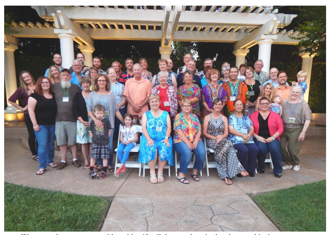
We regret that we were unable to identify all the members in the photo at this time.