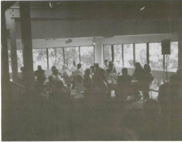
M embers enjoying dinner in the Accomack Room at Plimoth Plantation.