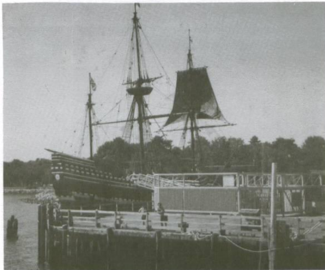
The Mayflower II at Plymouth Harbor.