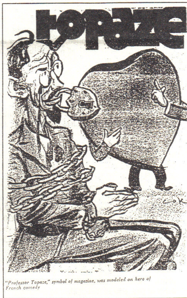
"Professor Topaze," symbol of magazine, was modeled on hero of French comedy