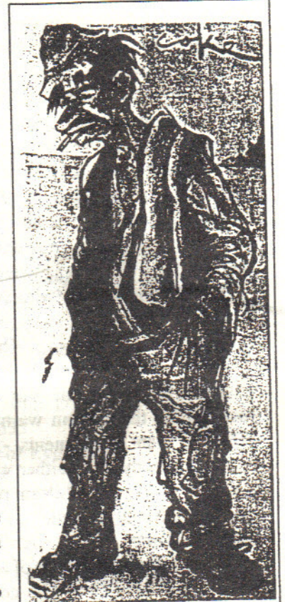
"Juan Verdejo Larrain," character created by Coke, represents Chilean people

Nevertheless, Topaze had its brushes with authority. Toward the end of his second term President Arturo Alessandri became so outraged by widespread criticism of some of his policies that one of his officials ordered the confiscation of an issue of Topaze that particularly displeased him (Alessandri apologized to Coke when he found out). Not content with having created a magazine