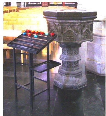
Baptismal Font in the Church of St. Christophe at Tourcoing

Thus Jean de Lanoy, son of Guilbert de Lanoy, was baptized on May 9, 1575, in the Roman Catholic parish church of St. Christophe at Tourcoing. Either his parents were still Roman Catholic or their Protestant views were kept secret. Calvinists did not reject their own baptisms that had occurred before they became Protestant. This attitude (against anabaptism) might have provided justification in dangerous circumstances for going along with having a child baptized according to Catholic ritual even when not agreeing with all aspects of it on theological grounds (such as the non-biblical rites of using salt and anointing with oil, of having the godparents swear, as stand-ins for the infant, the child’s rejection of the devil, etc.) So it is impossible to conclude that the family was still Catholic in 1575 even though their child was baptized in a Catholic ceremony.